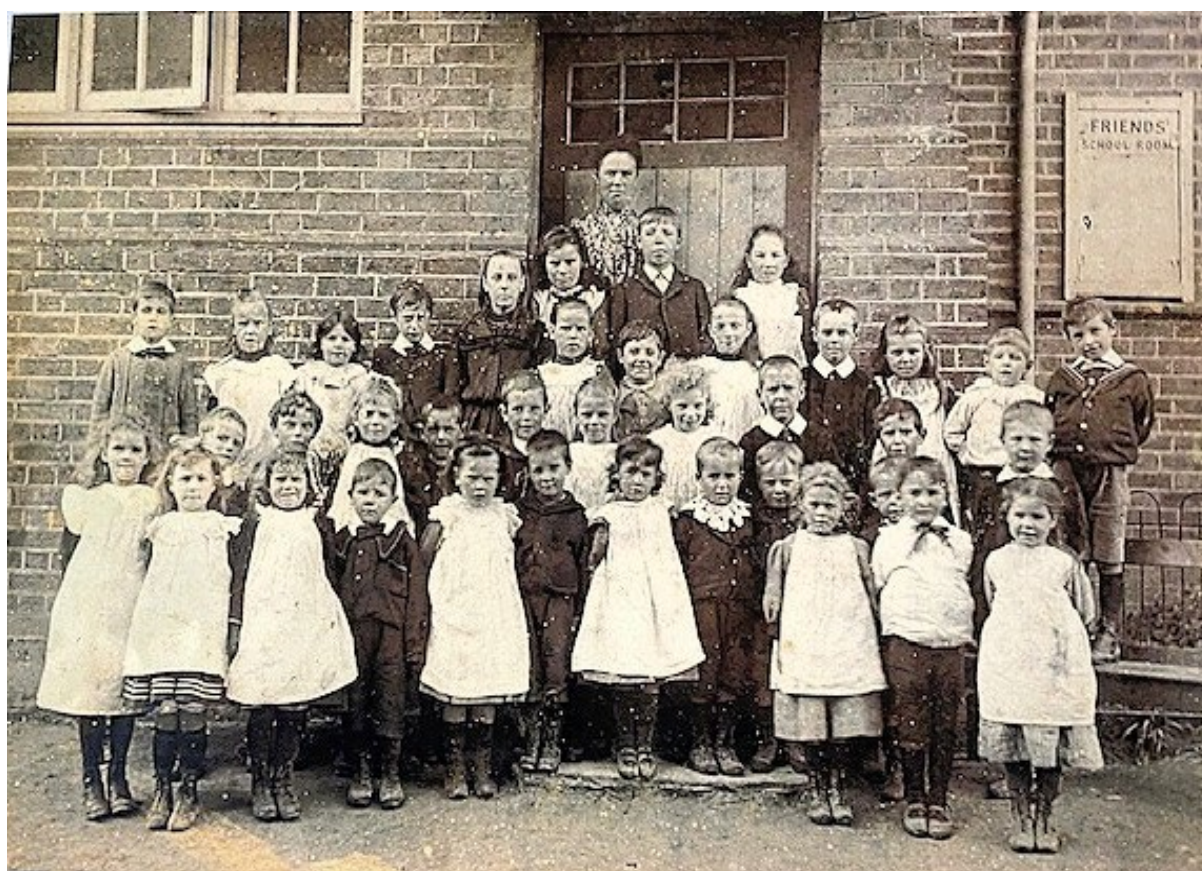
St Mary's School c1900

St Mary's School was built on the site of an old cottage along Ripley Lane and the junction with The Street, and the garden became the children's playground. There was also an orchard which was rented out with the funds given to the school. The style of the building is typical of the popular Gothic Revival mid 19th century village school, with moulded arched windows and a pitched roof.