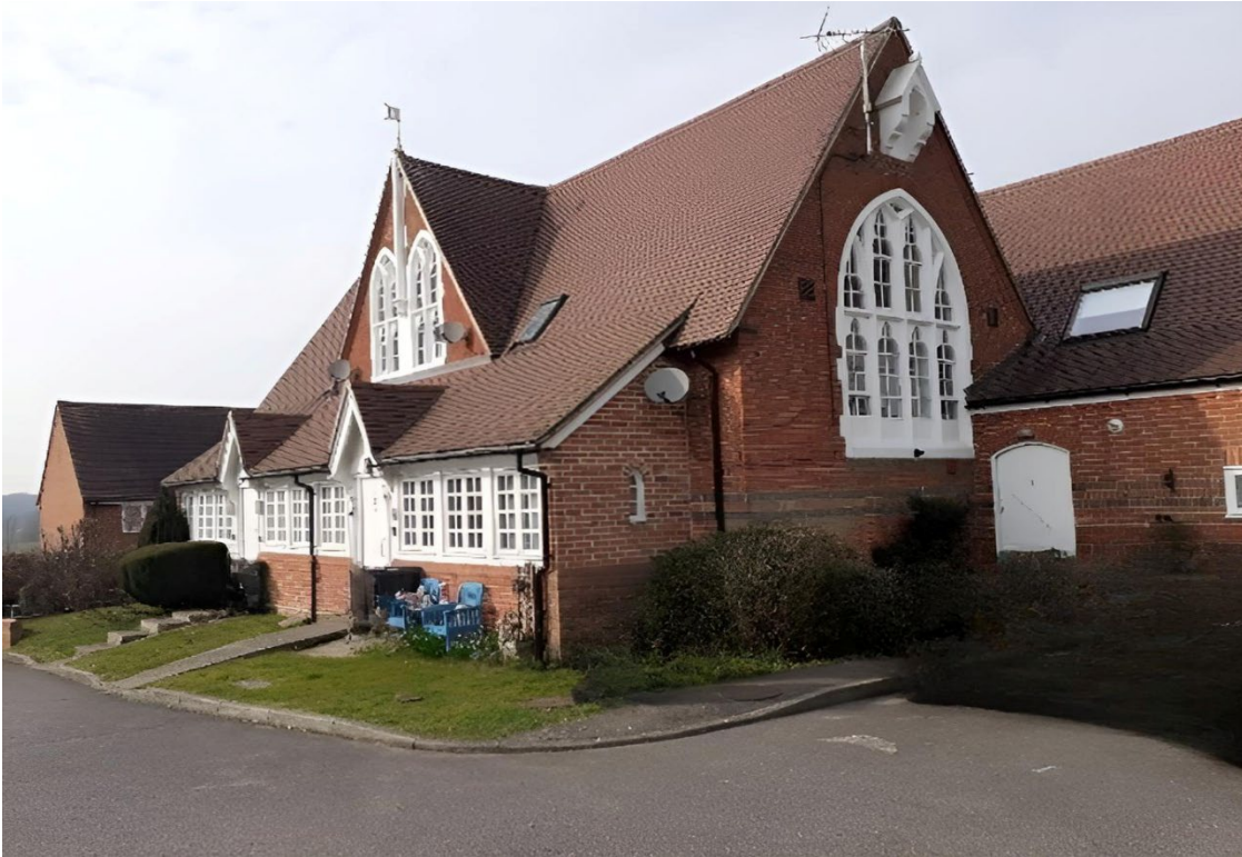
St Mary's School today – now apartments