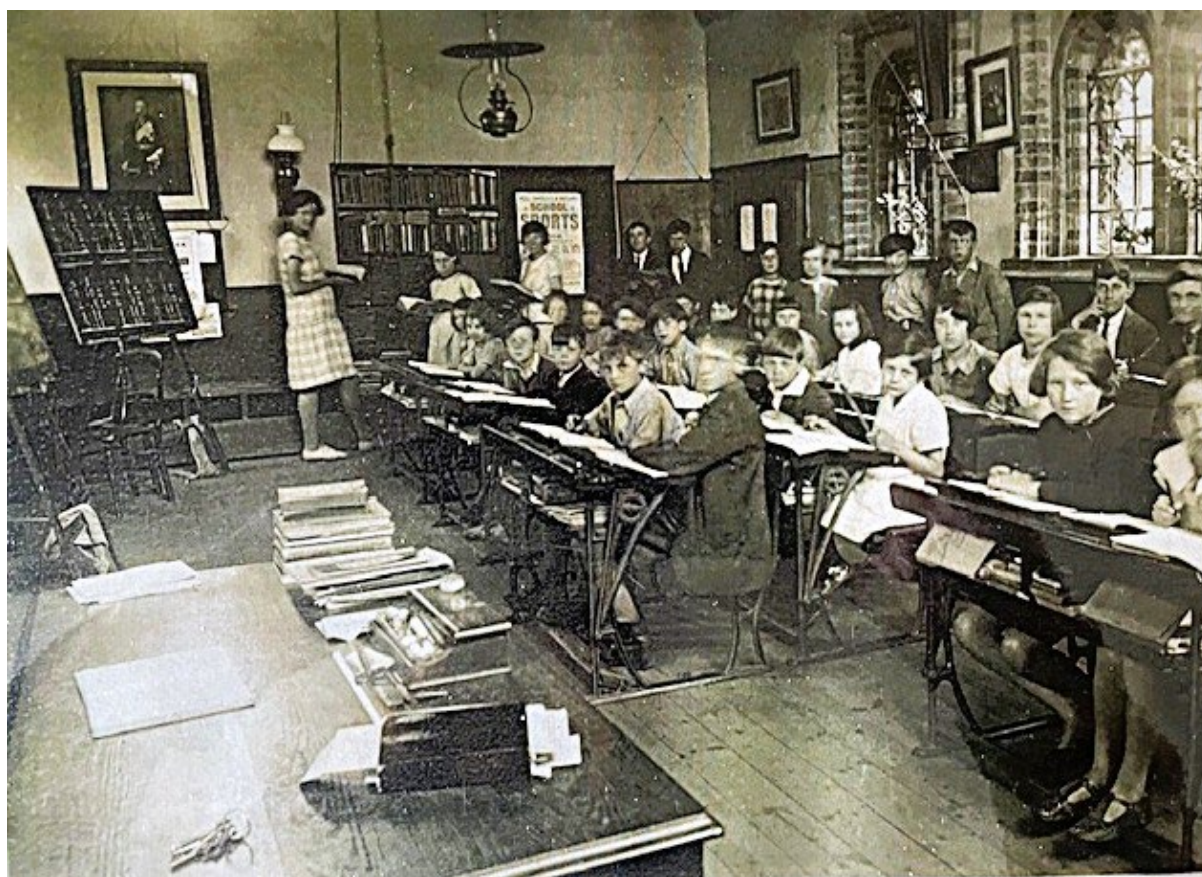
St Martins School c 1930