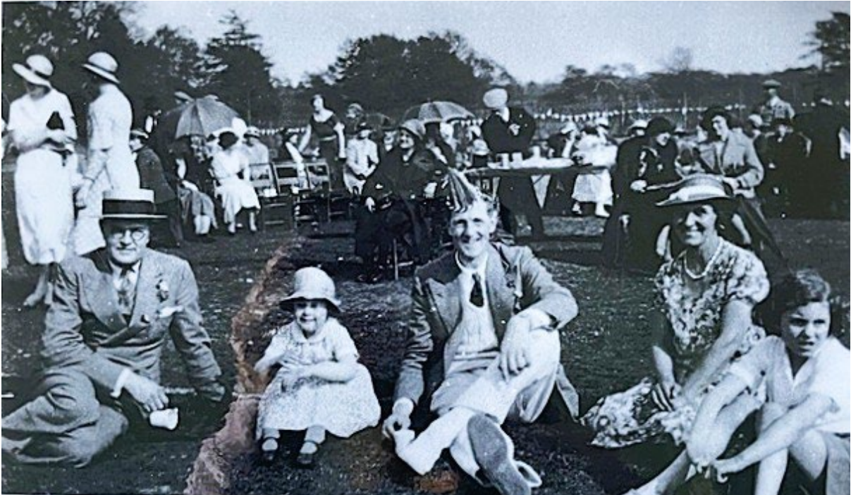
St Martin's School Pageant at Horsley Towers 1936

St Martin's School closed in 1964 due to a drop in attendance after the Raleigh School opened in 1960. The building however still exists and is now St Martin's House Business Centre.